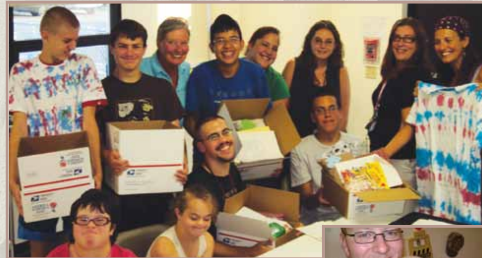
Above: Kids from Opportunities send some comforts from home to Iraq.

To inquire about Inspire's Opportunities Program, please contact Jeanne Northrup at (845) 294-7300 ext. 239. Members should have some functional communication and a desire to socialize with peers. Opportunities includes two social skills training meetings monthly. During these meetings members will plan and organize a community event each month.